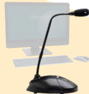
Mass communication and automation