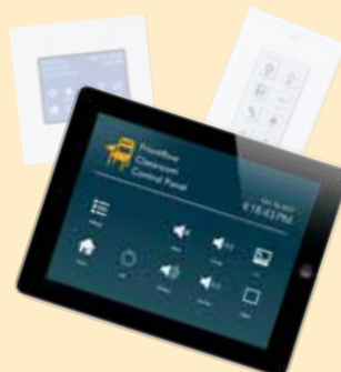
Control and monitoring options