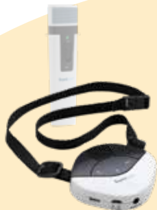
Microphones for classroom clarity

Whatever your communication vision, from basic to ambitious, FRONTROW can help you make it happen. Visit gofrontrow.com or call us for a free consultation.